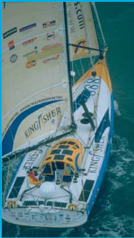
Kingfisher during the race